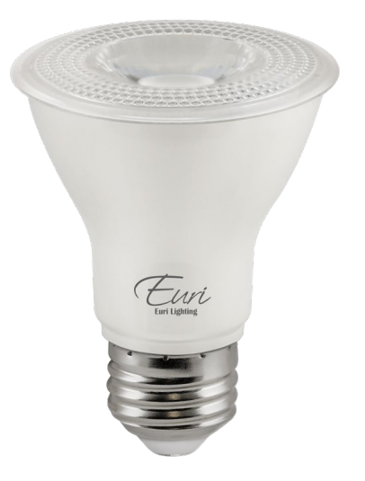
Available only as a twin-pack. (FP20-7W6000e-2 twin-pack contains 2 LED Bulbs)