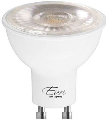
Available only as a twin-pack. (EP16-7W5020eG-2 contains 2 LED Bulbs.)

LED EP16-7W5020eG-2 delivers superior brightness, valuable energy savings, and long-lasting performance. This PAR16 LED bulb is ideal for ambient lighting or general-purpose applications due to its uniform *Warm White Light (2700K) and replaces conventional 50 Watt incandescent light bulbs. Look for EP16-7W5000eG-2 for Soft White (3000K), EP16-7W5040eG-2 for Bright White (4000K), and EP16-7W5050eG-2 for Cool White (5000K).