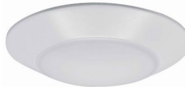
White Aluminum Housing & Frosted Plastic Lens