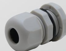
DS-PG-13.5 (Grey) DS-PG-13.5BLK (Black)