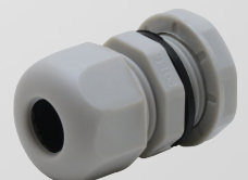
DS-PG-13.5 (Grey) DS-PG-13.5BLK (Black)